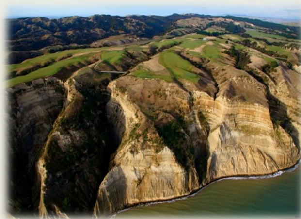
Spectacular views of Cape Kidnappers