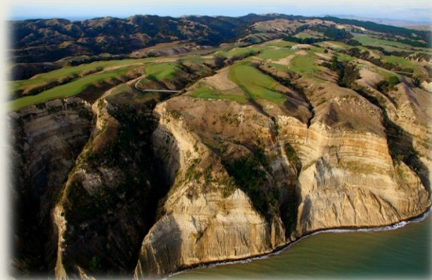
Spectacular views of Cape Kidnappers