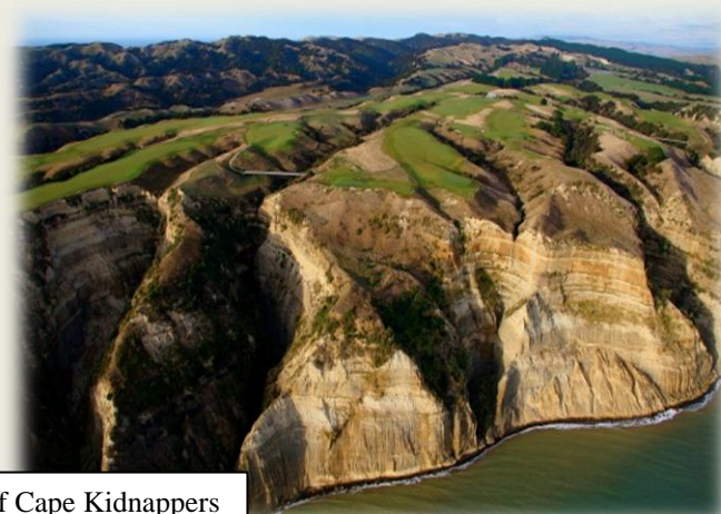
Spectacular views of Cape Kidnappers